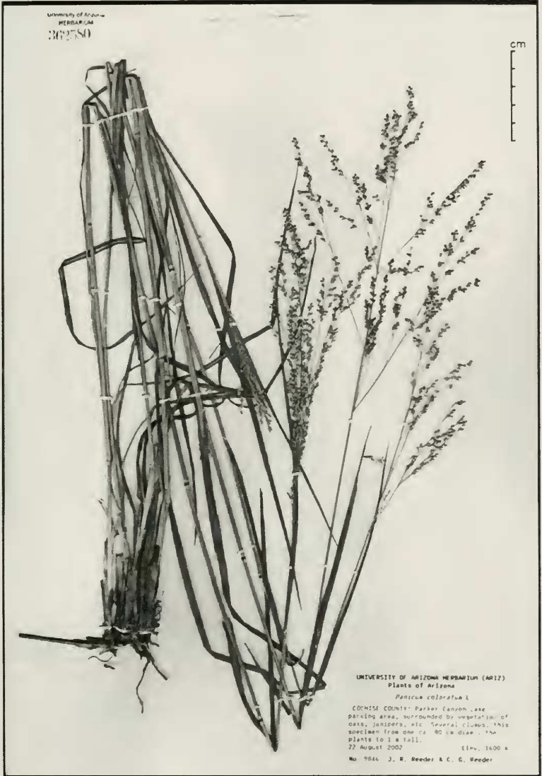
Fig. 1. Panicum coloratum L. Near Parker Canyon Lake, Cochise County, Arizona, 22 Aug 2002 (ARIZ).